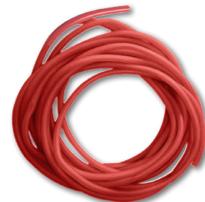
Silicone Rubber Tubing