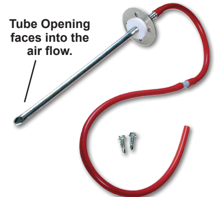
Total Pressure Probe Assembly